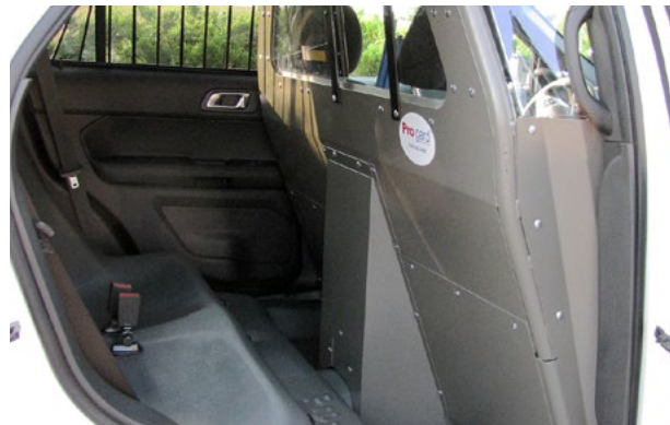
Space Saver Partition shown in the Ford Police Utility Interceptor