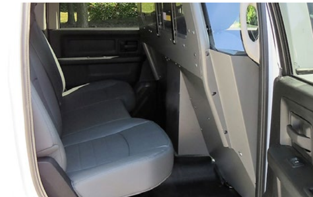
Space Saver Partition shown in the Dodge Ram SSV Truck