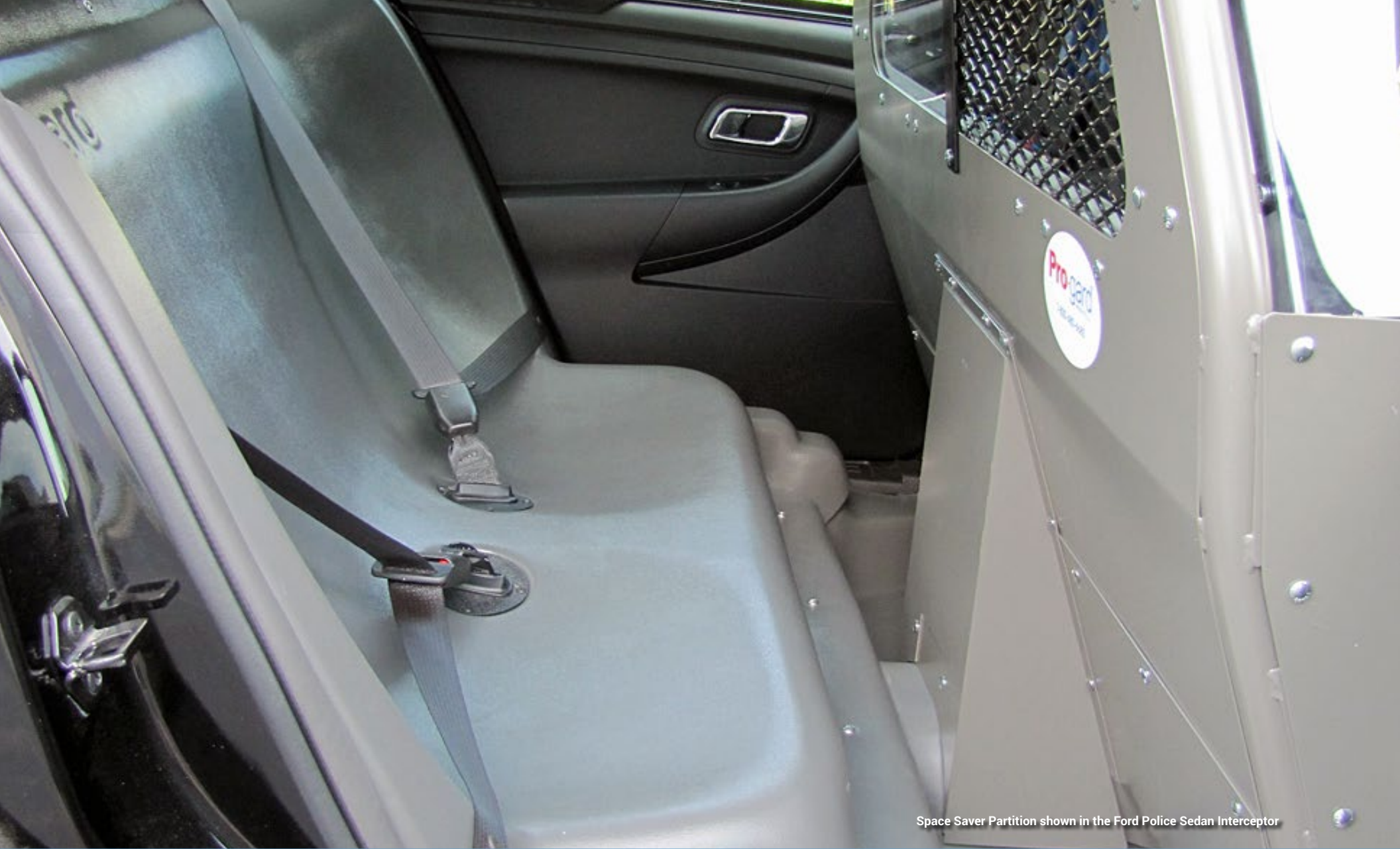
Space Saver Partition shown in the Ford Police Sedan Interceptor