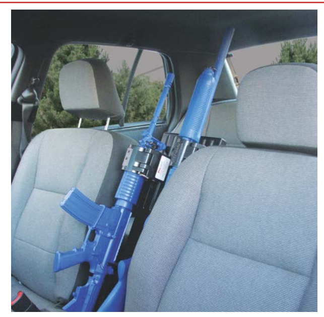
Vertical Self-Supporting Gun Rack shown in a Ford Crown Victoria