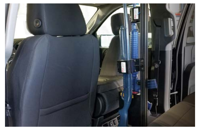
Shown in the 2019 Chevy Silverado