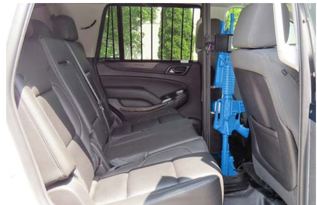
Shown in the 2018 Chevy Tahoe

The Tri-Lock Self-Supporting Gun Racks can secure up to two long guns and one handgun and be within easy reach of the officer. The Self-supporting Mount is perfect for detective, supervisor, and other police cruisers that do not utilize a partition.