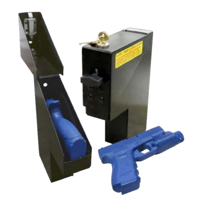
Patented Handgun Lock Box