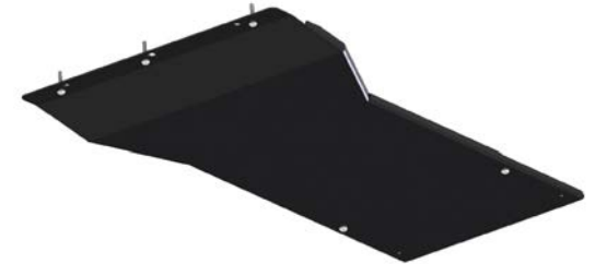
CAD rendering of the Transmission Skid Plate for the 2020 Ford Interceptor Utility