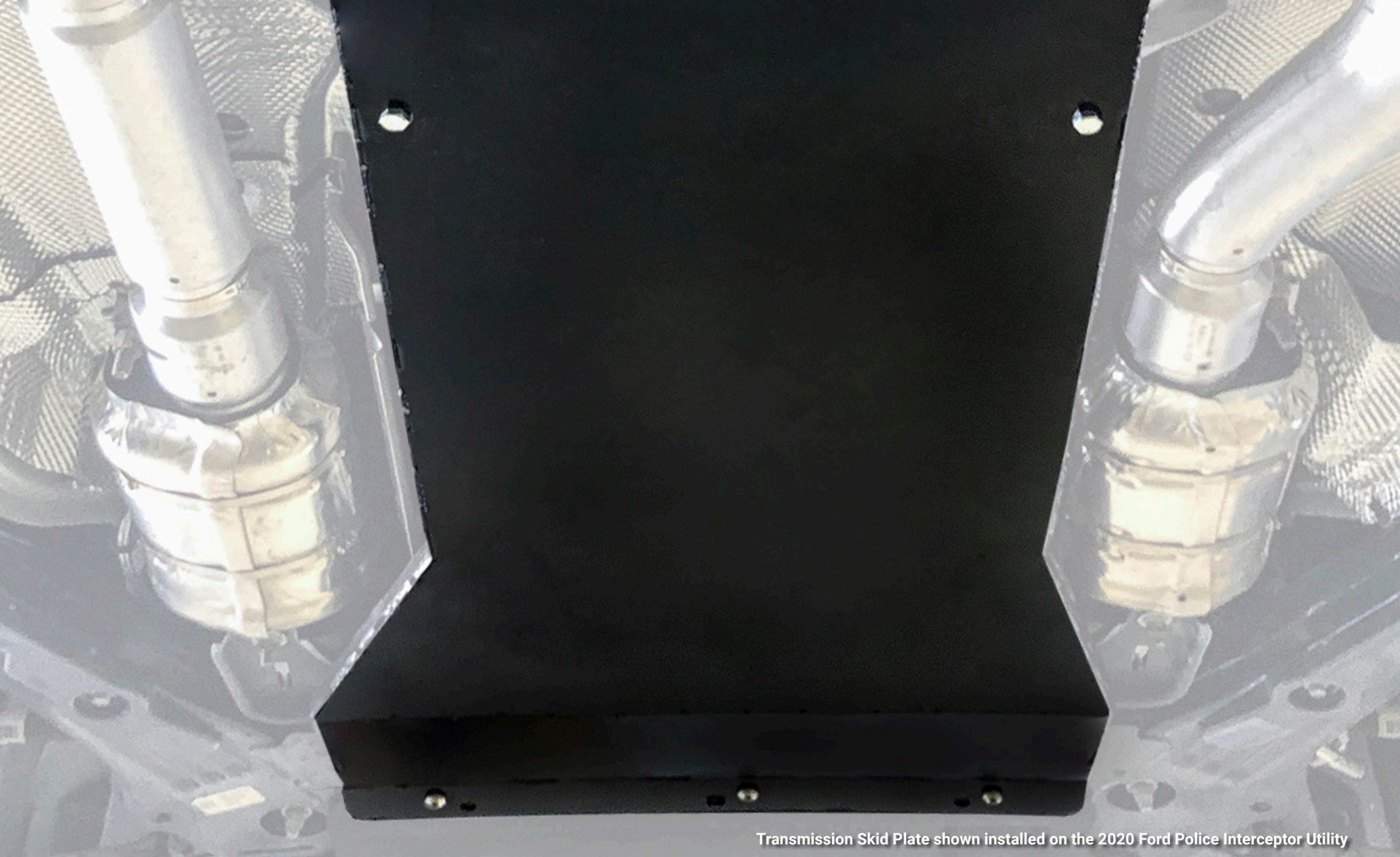
Transmission Skid Plate shown installed on the 2020 Ford Police Interceptor Utility