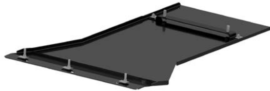
CAD rendering of the Transmission Skid Plate for the 2020 Ford Interceptor Utility