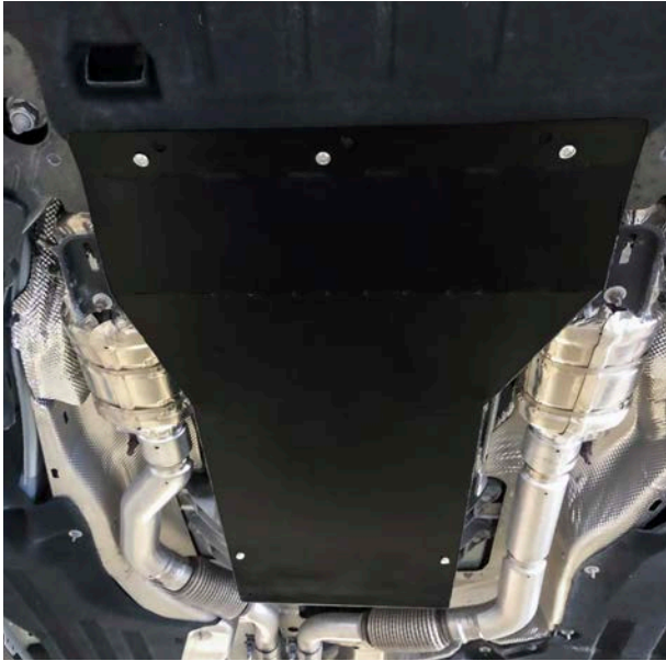
Transmission Skid Plate looking towards the rear of the 2020 Ford Police Interceptor Utility