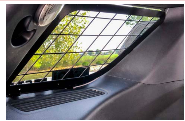
Shown inside the 2020 Ford Police Interceptor Utility