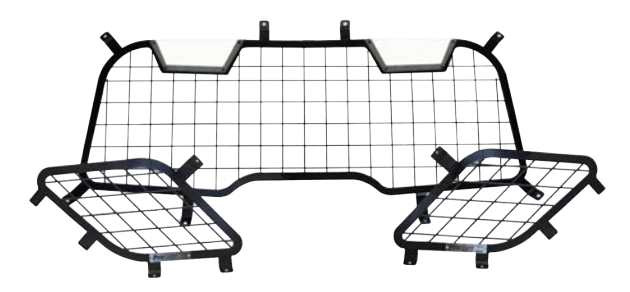
Rear Window Guard set for the Ford Police Interceptor Utility