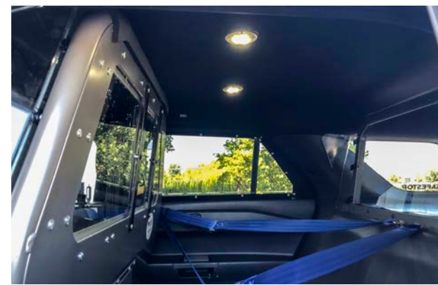
Brilliant White Prisoner Transport Lighting shown in a 2020 Ford Interceptor Utility