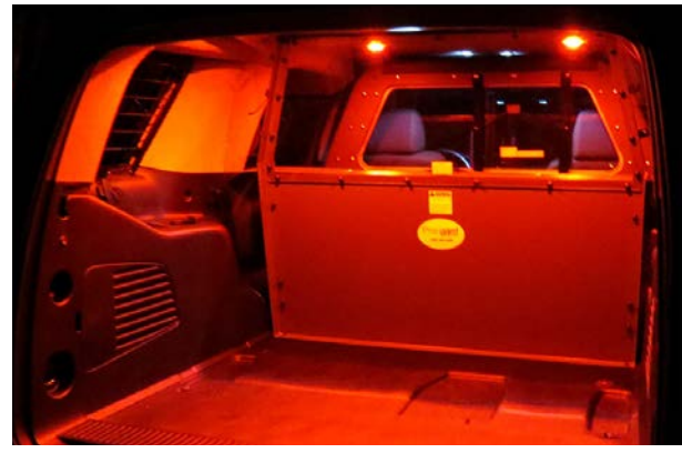
Ambient Red Prisoner Transport Lighting shown in a 2018 Chevy Tahoe