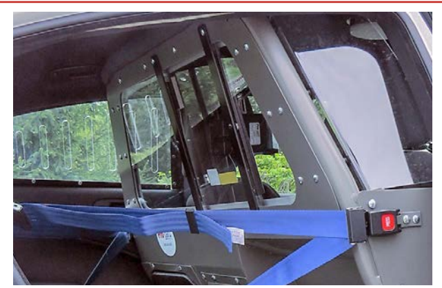
Center sliding polycarbonate window shown in the Dodge Charger