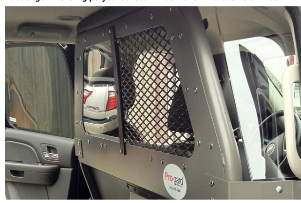
½ Polycarbonate, ½ expanded metal window shown in the Chevy Tahoe

Choose from up to 9 different window configurations to meet your prisoner transport needs. Center slide windows feature an ergonomic latch to aid in easy window operation from the driver's seat. Available with either durable ¼" thick polycarbonate or heavy-duty 14 gauge steel window. Anodized aluminum window frames are easy to clean and resist corrosion.