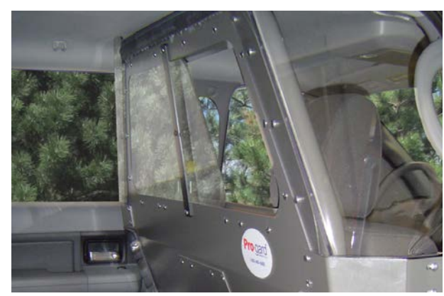
Passenger ½ sliding polycarbonate window shown in the Ford F150