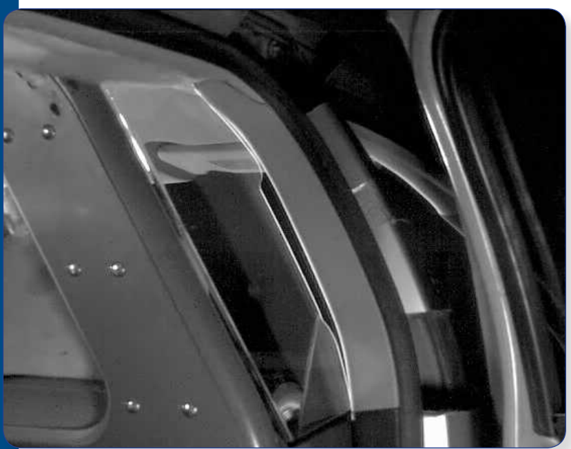
FILLER WING PRIOR TO AIR BAG DEPLOYMENT