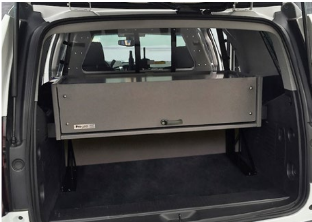
Shown in the Chevy Tahoe