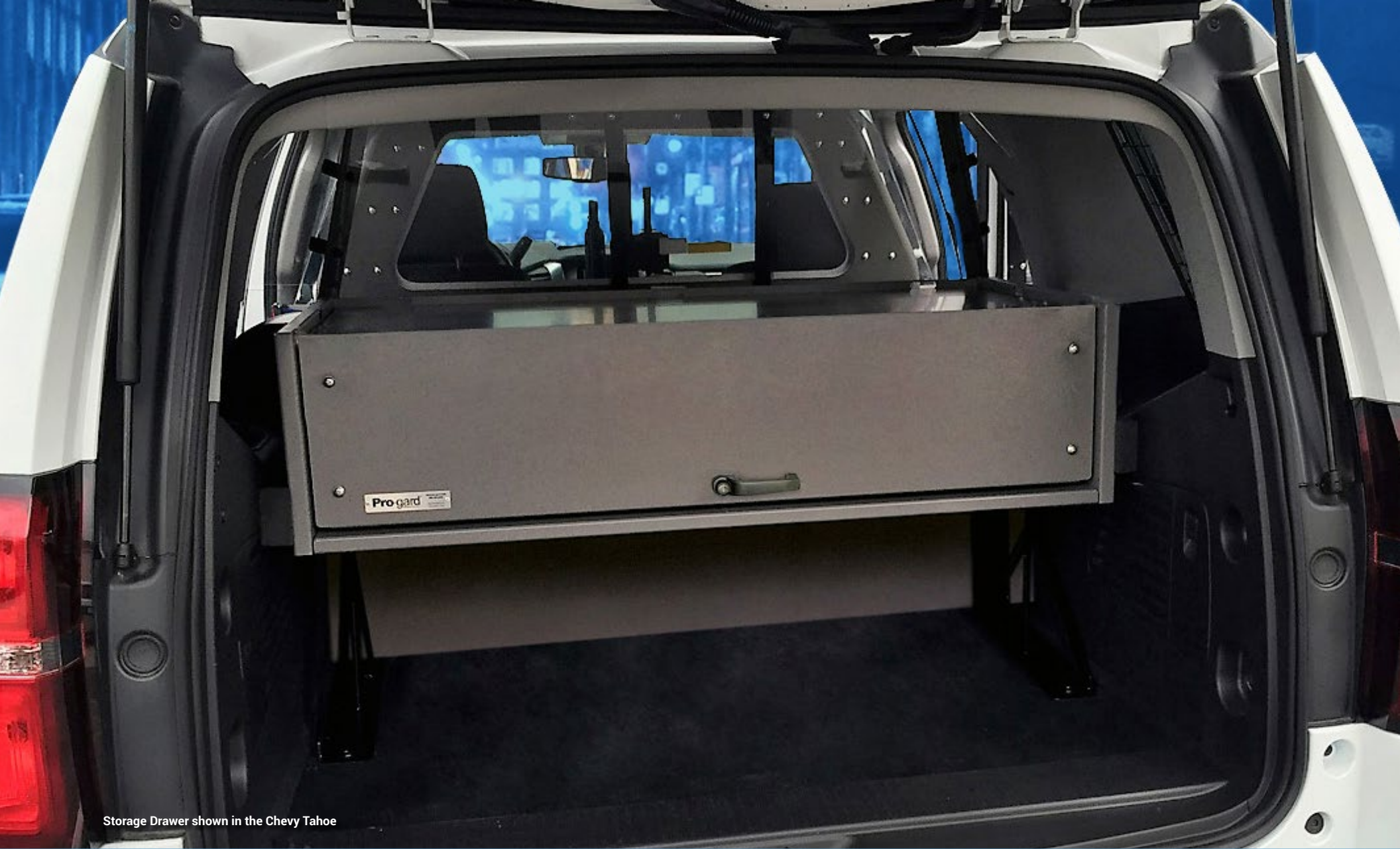
Storage Drawer shown in the Chevy Tahoe