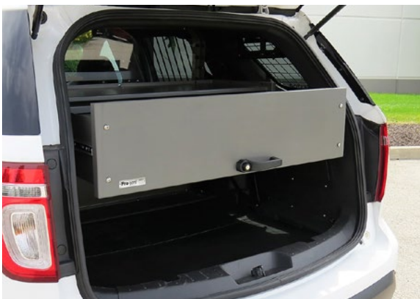
Shown in the Ford Police Utility Interceptor