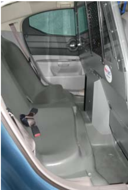
Shown in Dodge Charger