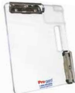
Left Hand NIJ Level I Ticket Board