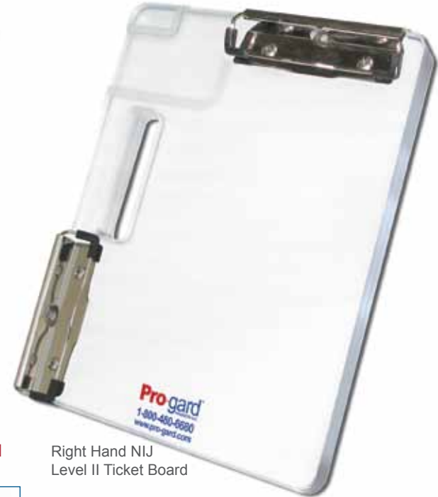
Right Hand NIJ Level II Ticket Board