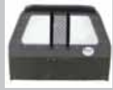
P1826 Full Cage Dual Prisoner Transport