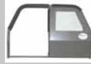
P1500 1/2 Cage Single Prisoner Transport